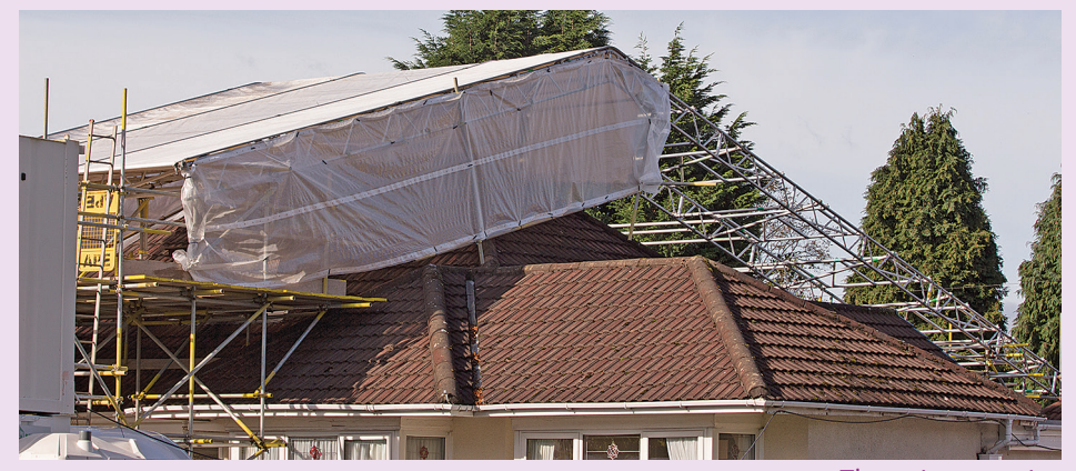
The attic conversion

Look out for our next newsletter in the New Year with some photos of the completed project.