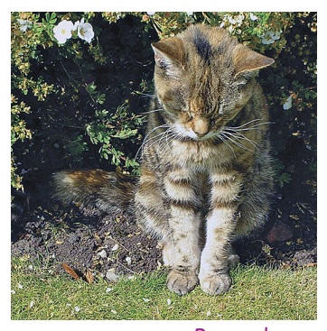
Poppy the cat

One of the comments of gratitude we hear a lot is that it is a 'Home from home'. In fact a lovely story I'd just like to share is about a stray cat that come to us last year. We did all the practical things to try and reunite her with her owner, but no one claimed her and all the sanctuaries were full. We fed and cared for her and prayed to see her sense of home as complete. We named her Poppy! One of the daughters of a guest staying with us embraced her into her home and Poppy settled well into her new